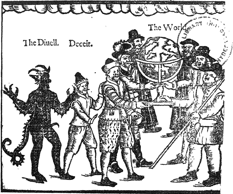
THE WORLD TOST AT TENNIS The First Quarto

Inuented and ser downe, By } Tho: Middleton } & } Gent. } William Rowley }