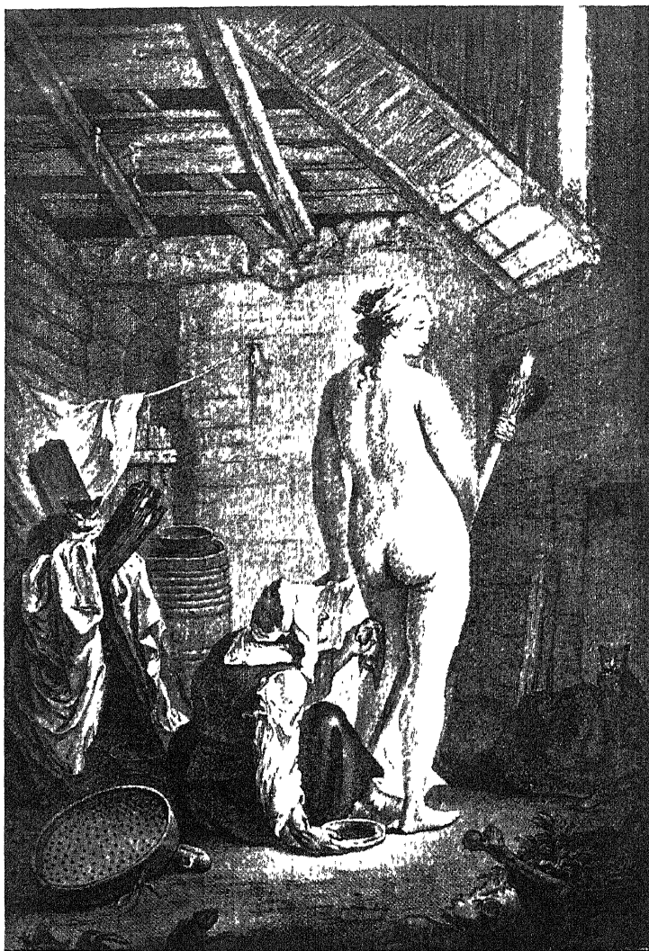
OFF TO THE SABBAT Queverdo