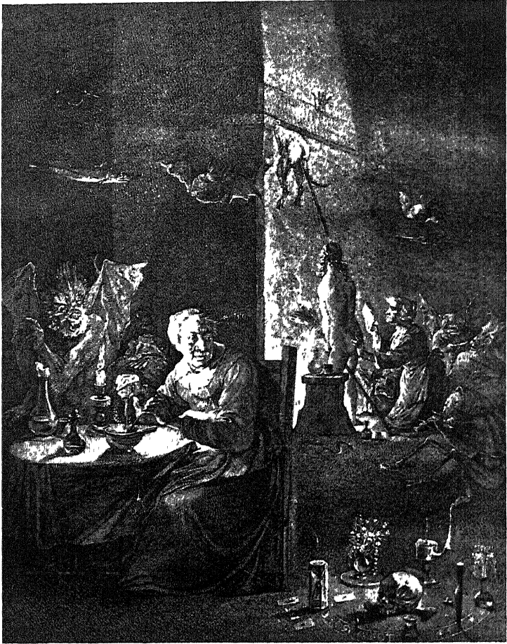
THE DEPARTURE FOR THE SABBAT David Teniers